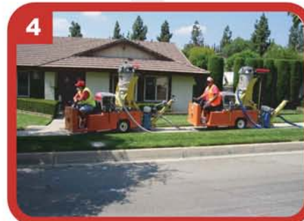
4 Move to next location