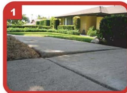
1 Survey to identify trip hazards