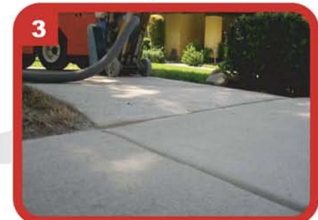
3 Trip hazard eliminated