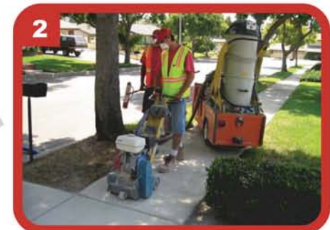
2 Grind trip hazards